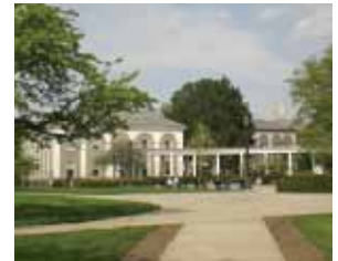
ROGER HULL PLAZA