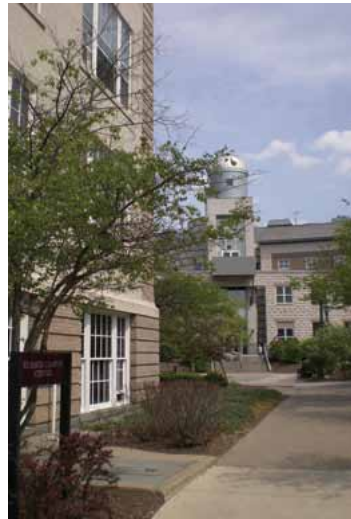
REAMER CAMPUS CENTER AND OLIN CENTER

An addition to the existing campus center will combine the two main dining facilities and provide space for other campus life functions. The Campus Plan also includes renovation of existing student residences and identifies possible sites for new construction. Athletics and recreation improvements will include renovation of the existing field house.