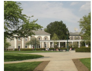
ROGER HULL PLAZA