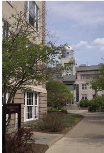
REAMER CAMPUS CENTER AND OLIN CENTER