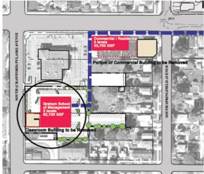
CAMPUS PLAN SITE LOCATION