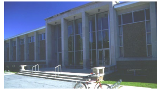
GRIFFITHS ART CENTER