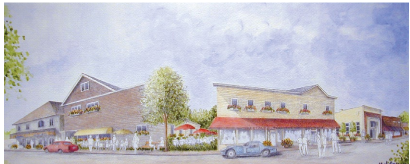
CONCEPT DRAWING HOW THE DOWNTOWN COULD BE REVITALIZED