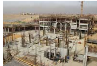
SCHOOL OF HUMANITIES AND SOCIAL SCIENCES (Under Construction Winter 2006)

The second phase involved submitting the draft program to a variety of analyses to confirm that the statement of needs would both truly support AUC's vision, while not creating an unaffordably large project. Peer comparisons at the campus and departmental level were conducted; the combined departmental requests were consolidated and streamlined for efficiency; and preliminary statements of school, unit and departmental adjacency were considered to ensure rational distribution of space resources.