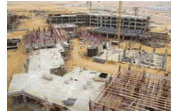
SCHOOL OF SCIENCE AND ENGINEERING (Under Construction Winter 2006)